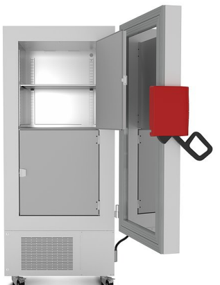
Model UF V 500