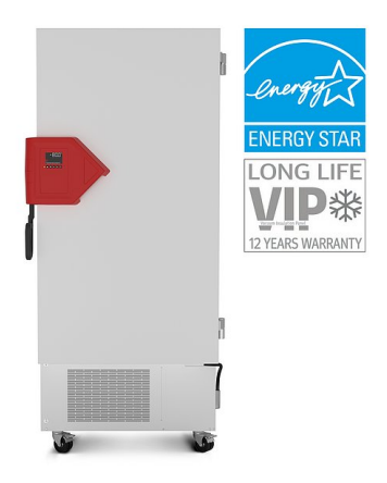
Model UF V 500